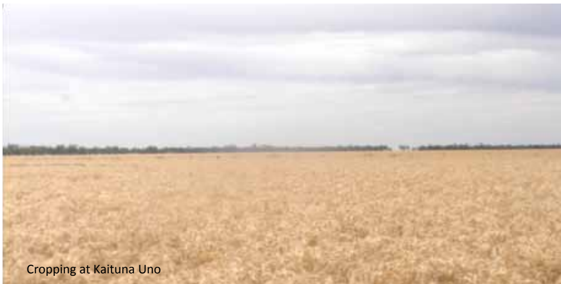
Cropping at Kaituna Uno

The success of any enterprise is reliant upon strong leadership and governance. The strong leadership and governance of Aboriginal Land Councils will remain the foundational focus of this policy.