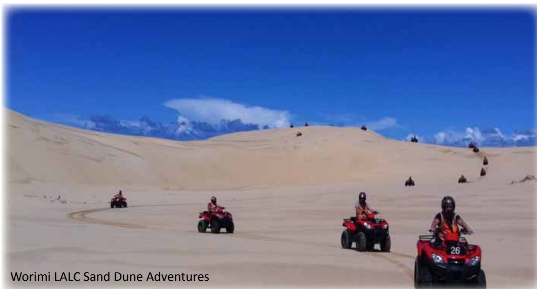
Worimi LALC Sand Dune Adventures

The NSW Aboriginal Land Council will continue to explore other business enterprise opportunities.