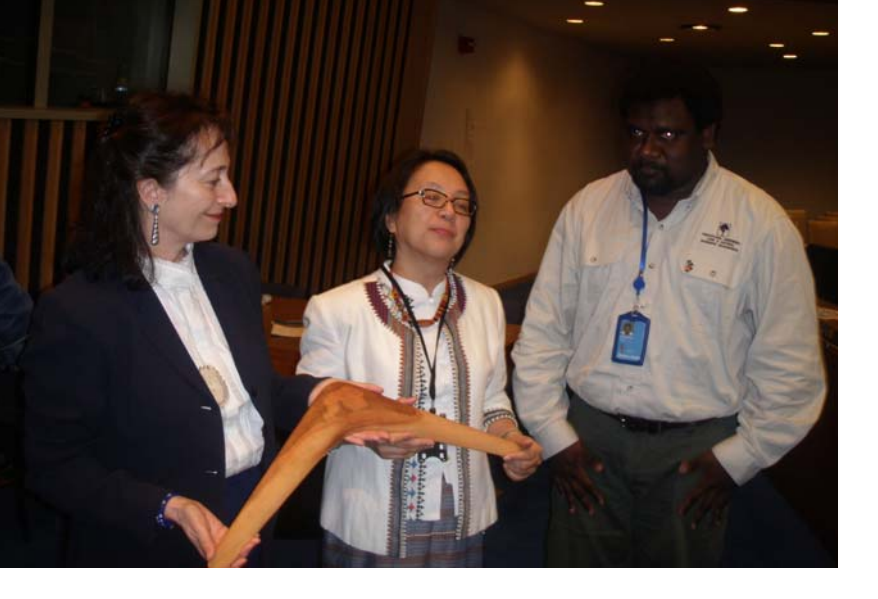
Photo: Presentation of a Boomerang to the United Nations Permanent Forum on Indigenous Issues.