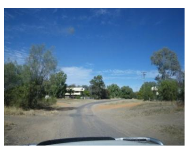
Figure 2: Streetscape

Located - 3km from town; Zoned - 1(A) Non-Urban; Access - Crown Road; Dwellings – 22; Other Buildings - Community facilities; Flooding and Drainage – flood prone, no levee but highset houses, erosion due to poor drainage and steep slopes; Road Condition - bitumen, roll kerb and guttering in places, no drainage; Water Supply - town water supply; and Sewage Provision - individual Enviro-cycle treatment systems.