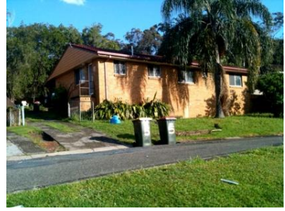
Figure 5: Typical House