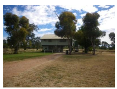
Figure 3: Typical house