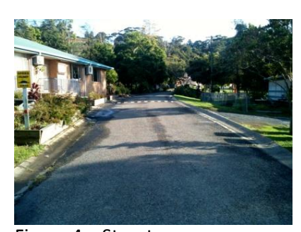
Figure 4: Streetscape

Located - 3km North of town centre; Zoned - 2(A) Low Density Residential; Access- Crown Road; Dwellings- 12 dwellings; Other Buildings - Community facilities; Road Condition - Sealed, unnamed, narrow roads; Water Supply - Town water supply; and Sewage Provision - Town sewerage.